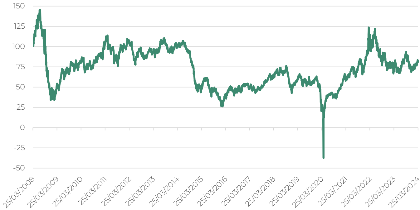
WTI Crude Oil

Important Information: The chart above represents the historic performance of the Underlying Commodity and should not be relied upon as an indication of future performance.